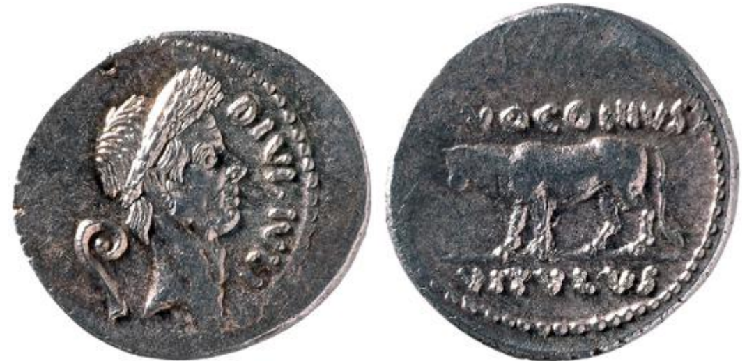
Denarius of Q. Voconius Vitulus, 40 or later. Obverse: Deified Caesar. Reverse: Calf.

Perhaps this one, last privilege was the straw that broke the camel's back. Since 13 February 44, Caesar was authorised to mint his effigy on coins. This was unheard-of in Rome, this was unthinkable. Plus, Caesar was wearing a sort of crown on these coins, inherited from the Etruscans and presumably reminiscent of the triumphator, who, however, had only worn it on the day of his triumph. This image became iconic. In the dispute about Caesar's succession it was repeatedly taken up and minted by the followers of Octavian and Marc Antony.