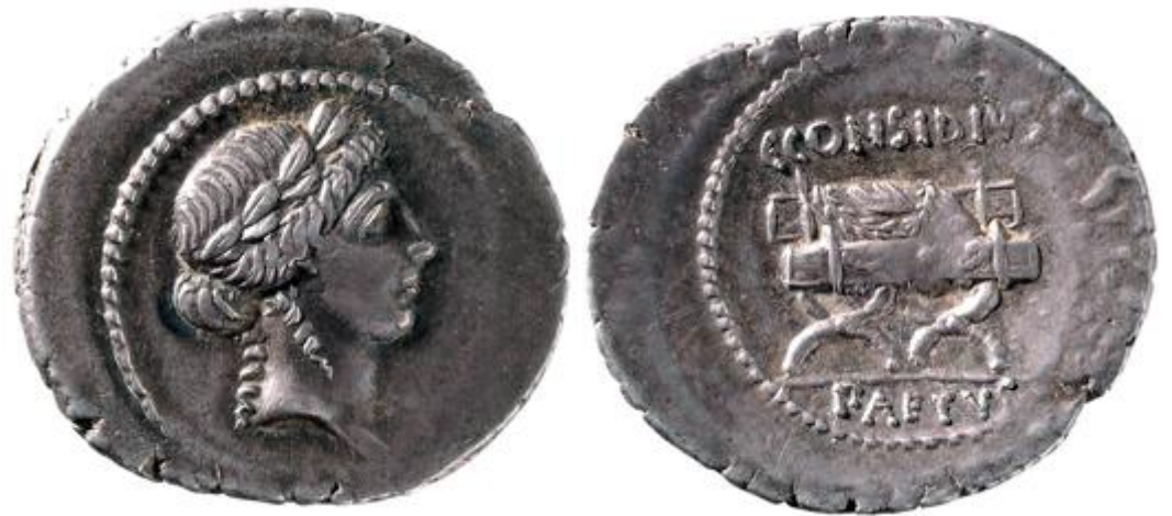
Denarius of C. Considius Paetus, 46. Obverse: Apollo. Reverse: Sella Curulis, Caesar's laurel wreath on top.

Caesar had become untouchable. He amassed honours and privileges. The laurel wreath on the Sella Curulis perhaps alludes to his privilege of sitting in between the two consuls during sessions of the senate.