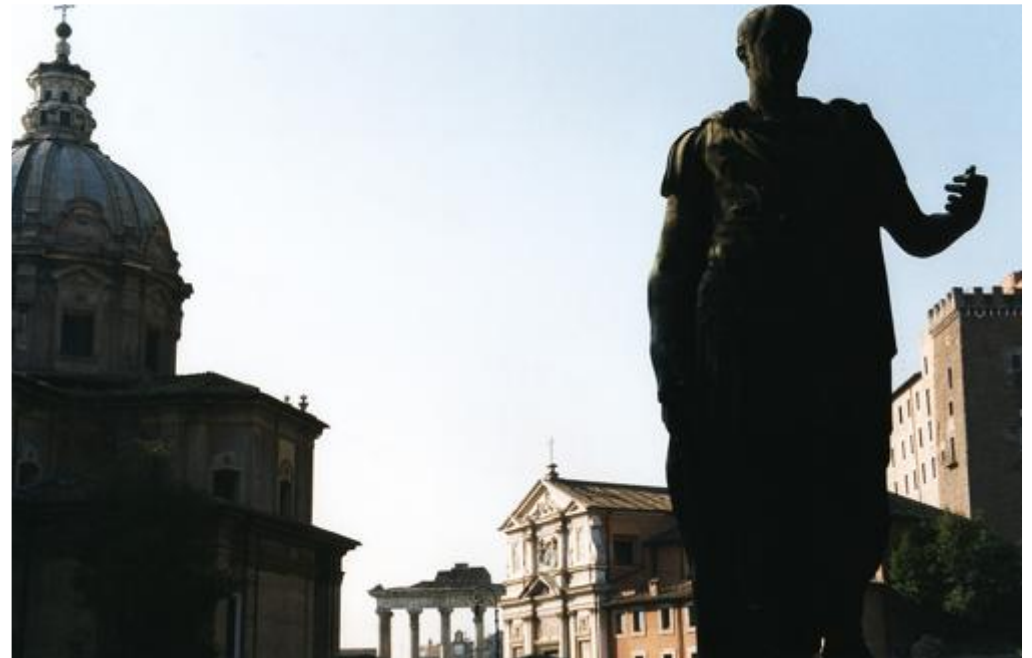
Statue of Iulius Caesar, Via dei Fori Imperiali, Rome.

On top of losing their political power, angry senators were confronted with Caesar wherever they went. One statue of him was put up next to the memorials of the seven kings of Rome. Another one in the Temple of Jupiter, bearing the inscription 'To the invincible god'. An ivory statue of Caesar became part of every procession held in honour of the gods. The old elites were furious.