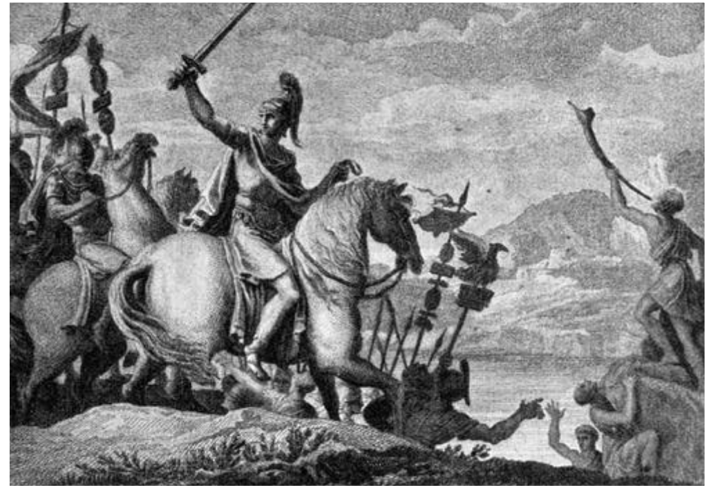
Caesar crossing the Rubicon. Reproduction of an unknown painting.

His victories in Gaul had won Caesar so much influence that he seemed almost overpowering. That made even his former allies uncomfortable. Pompey allied with Caesar's enemies and demanded his return to Rome. Under no circumstances could Caesar let that happen because losing his office meant losing his legal immunity and possible conviction. His enemies had enough on him to arraign him. This, however, was not acceptable for Caesar and irreconcilable with his pride. He turned to his loyal soldiers. In the night from 10 January to 11 January 49, he and his legions crossed the Rubicon, the small river on the border of his province of Gallia Cisalpina and Italy. The civil war had begun.