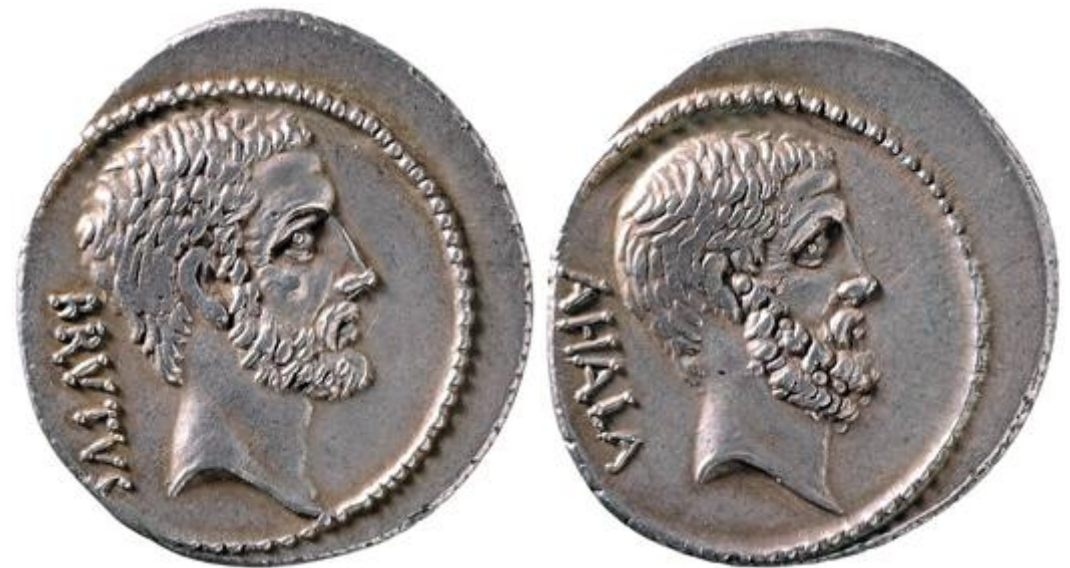
Denarius of M. Iunius Brutus, 54. Obverse: Head of Brutus, consul in 509. Reverse: Head of Gaius Servilius Ahala.

More than anyone else, Marcus Iunius Brutus had conveyed the clear message on his coins that he would not tolerate a tyrant. This coin of his shows Lucius Iunius Brutus, the legendary first consul and founder of the Roman Republic. The reverse portrays Gaius Servilius Ahala, who was known for killing a man because he suspected him of striving for autocracy.