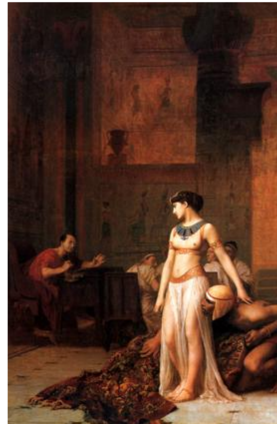
Cleopatra before Caesar, painting by Jean-Léon Gérôme, 1866.

In Egypt, 53-year-old Caesar met Cleopatra, an intelligent young woman of 21 years of age. He installed her as pharaoh. And there was more to come: She also became his lover and mother of his only son Caesarion.