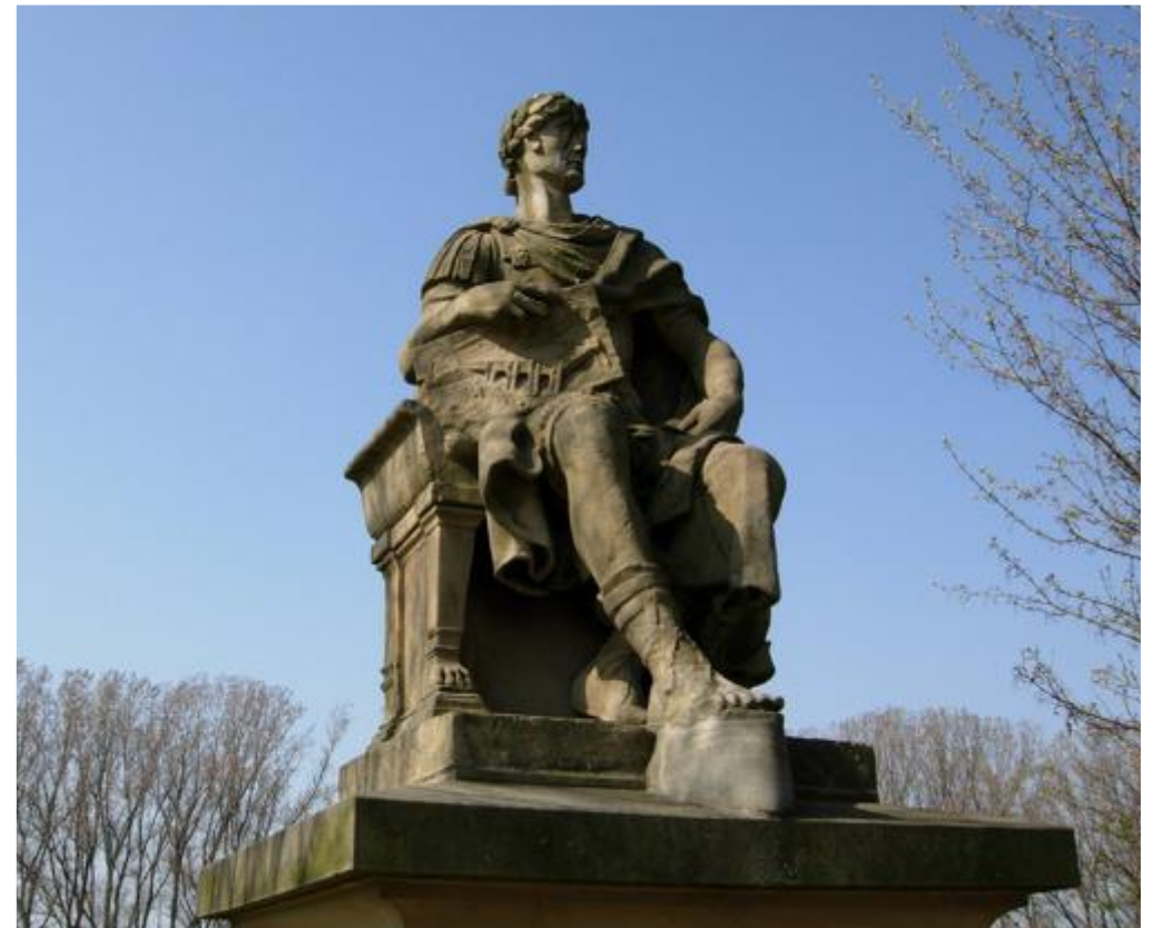
Caesar memorial, Bonn (Germany).

Caesar introduced a new calendar and initiated large-scale projects for buildings and settlements. But no matter what he did, there was one thing he just could not do: Win the respect and approval of the aristocracy. This was largely due to the problem that high offices had lost their appeal. Even high-ranking officials could not make an impact anymore as Caesar was the de facto autocrat.