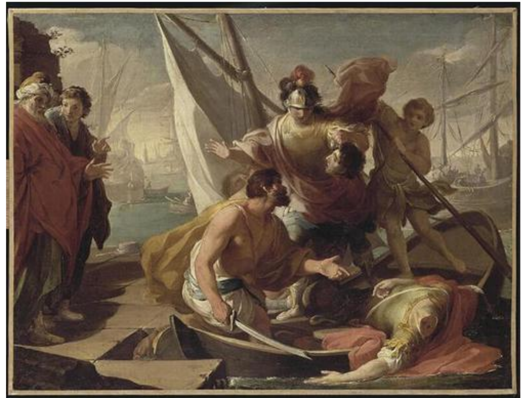
Pompey's death. Painting by anonymous painter, 2nd half of 18th century. Musée Magnin, Dijon.

Pompey fled to Egypt. But Pharaoh Ptolemy XIII chose the more promising side. On his arrival in Alexandria, Caesar was greeted by his enemy's cut-off head.