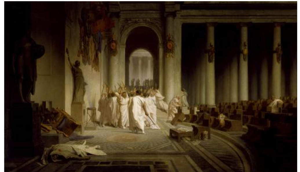
Caesar's death. Painting by Jean-Léon Gérôme, between 1859 and 1867. Walters Art Museum, Baltimore.

On the Ides of March, 15 March 44, some 60 senators assassinated the man who had used his money to turn their political system of clientilism against them and upset the order of the Roman Republic.