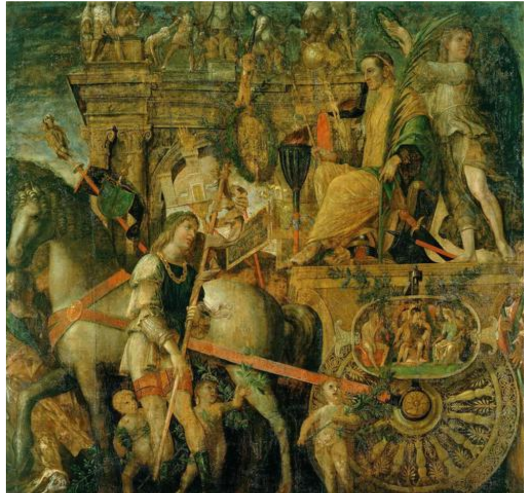
Julius Caesar on his triumphal chariot, painting by Andrea Mantegna,

Even though the Battle of Zela earned him not only a swift victory but also the phrase 'Veni vidi vici', it still could not win the successful general the respect of the other Roman senators.